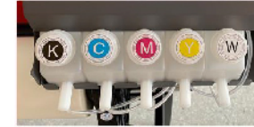
White Ink Stir&Cyclic System